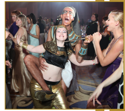
Guest in Egyptian costume at the Egyptian Gala Dinner.