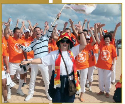
Team building at the Zepter Olympic Games.