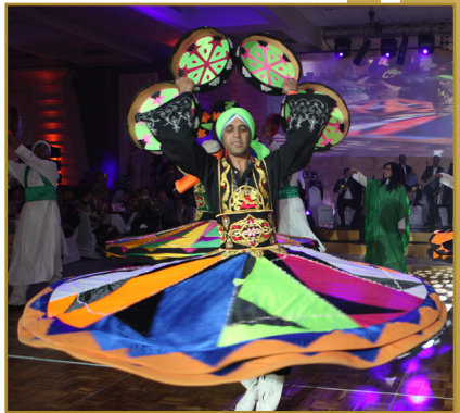
Whirling Dervish dancers wow the crowd at the Big Zepter Show.