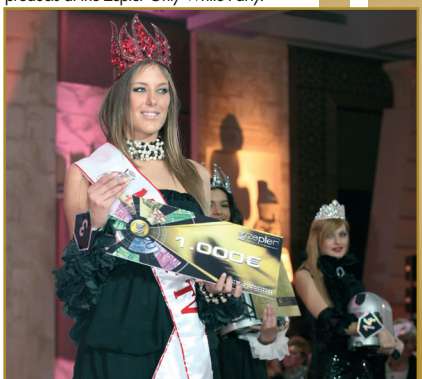
Zepter's Miss Golden Age, form Serbia.