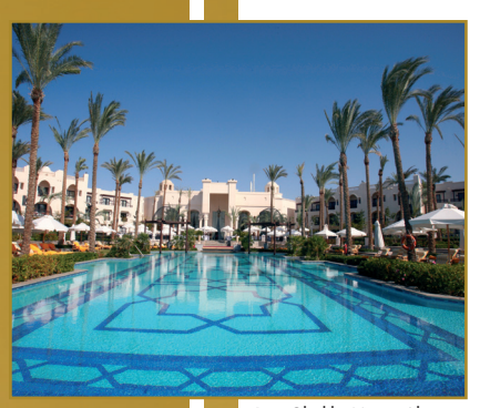
Port Ghalib, Marsa Alam, Egypt provided a stunning backdrop for the event.